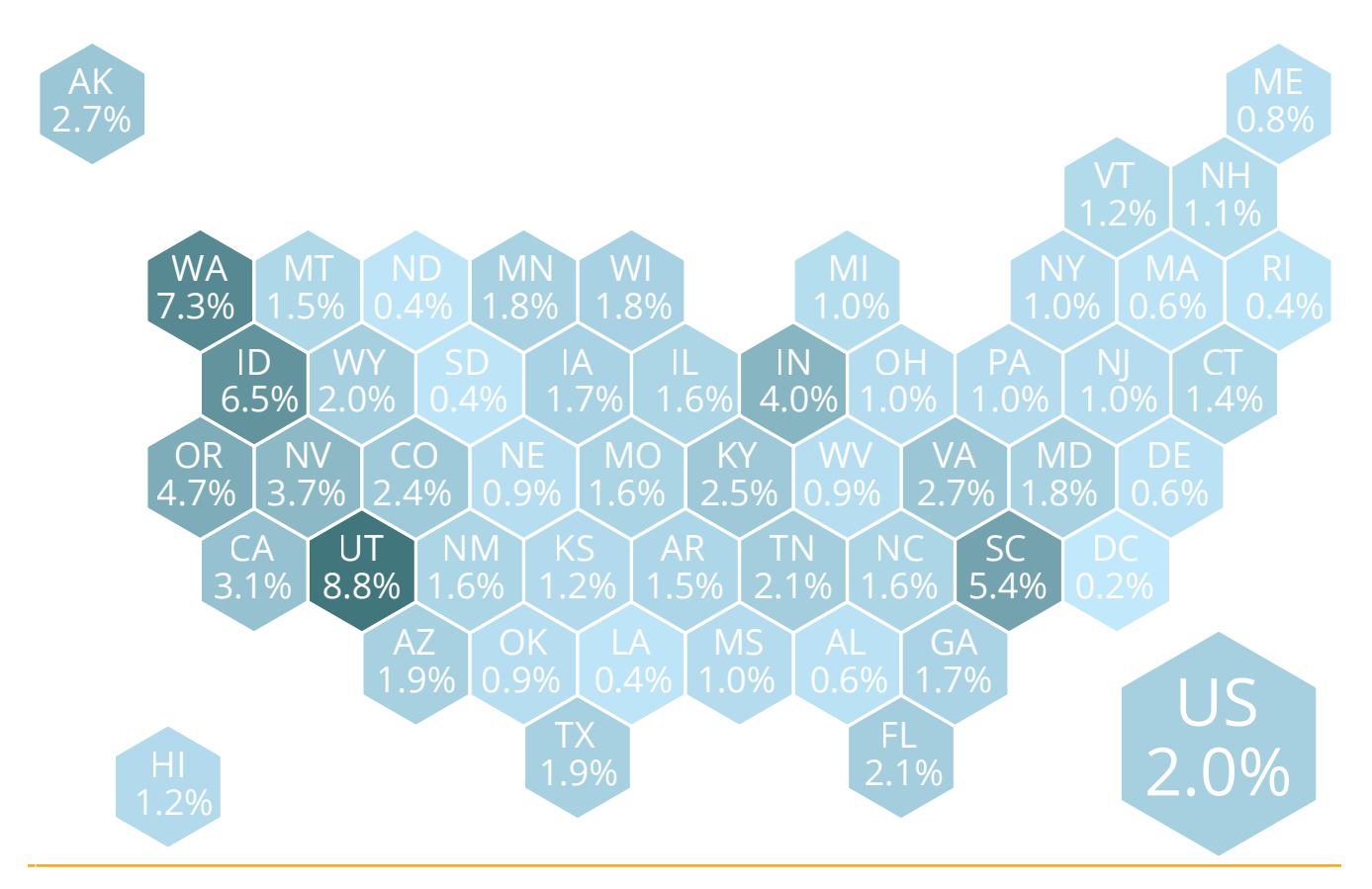
Figure 3: WGU Nurses as a Share of Total Registered Nurses in Each State, 2022